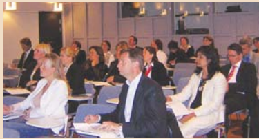
Industry Partners during the gathering.