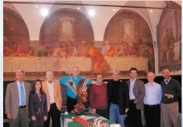
Executive committee at the Franciabigio Hall.

stressing his expertise as past-treasurer of the British Society of Periodontology. The proposal was unanimously approved by the General Assembly.