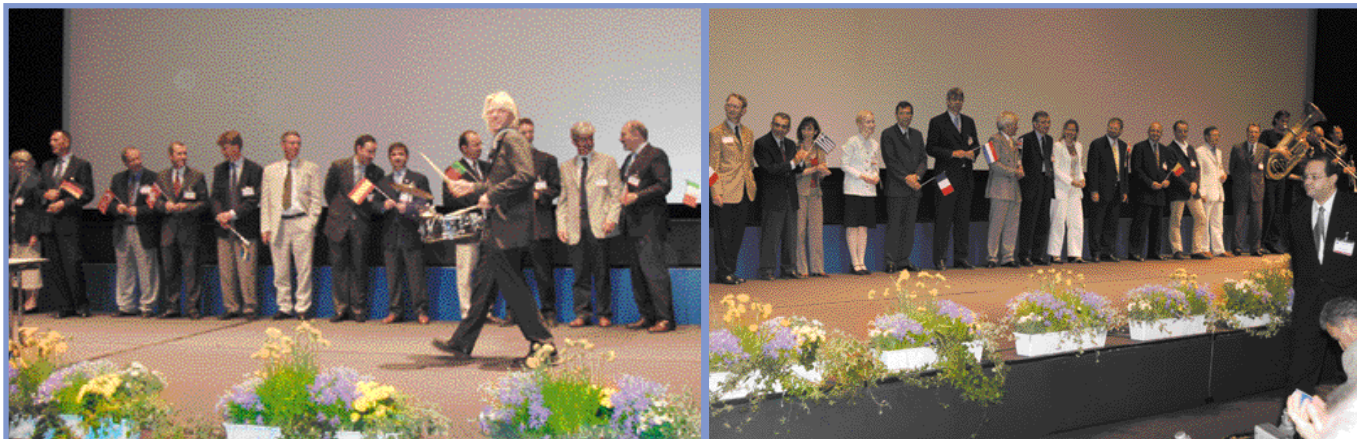
Call of Nations. Representatives from all national societies at the Opening Ceremony

followed by the Welcoming Reception, which gave the participants an opportunity to meet their colleagues and business partners.