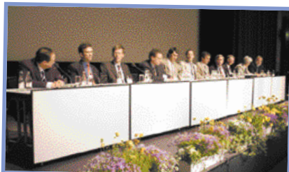
The panel of experts during the debate