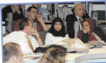
Participants came from all over the world