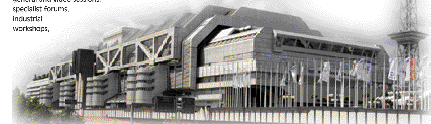
International Congress Center (ICC) in Berlin